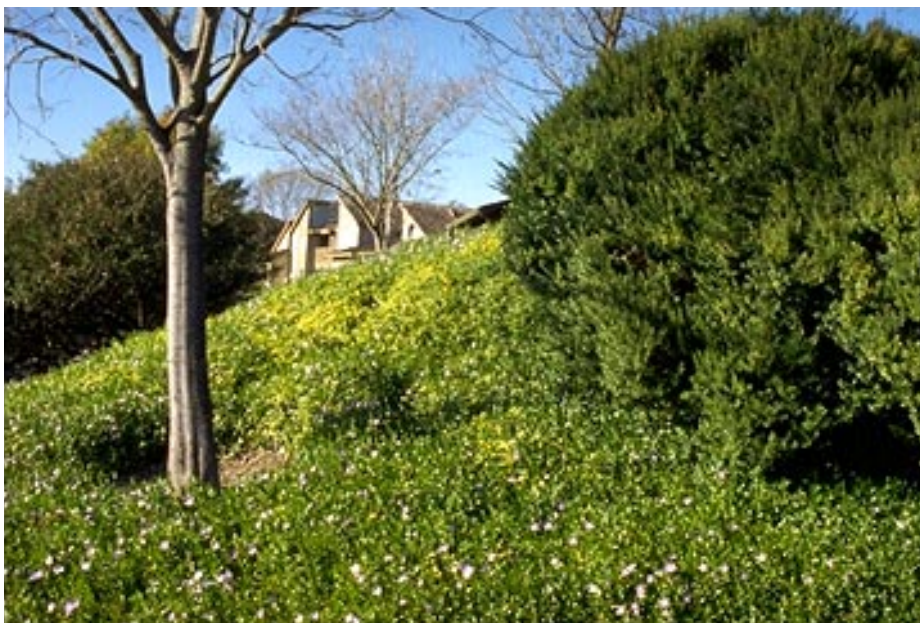
Landscapes are frequently composed of plants of various heights: trees, groundcovers, and shrubs. Due to the typical growth form of each vegetation type, “tiers” of vegetation result. Plantings with more than one tier are likely to lose more water than a planting with a single tier. Here, the trees and shrubs in the groundcover represent a higher water loss condition than if the groundcover occurred alone. The density factor accounts for differences in vegetation density.

In most cases, the presence of vegetation tiers in landscapes constitutes a high density condition. For example, a planting with two or three tiers and complete canopy cover would be considered to be in the high ka category .