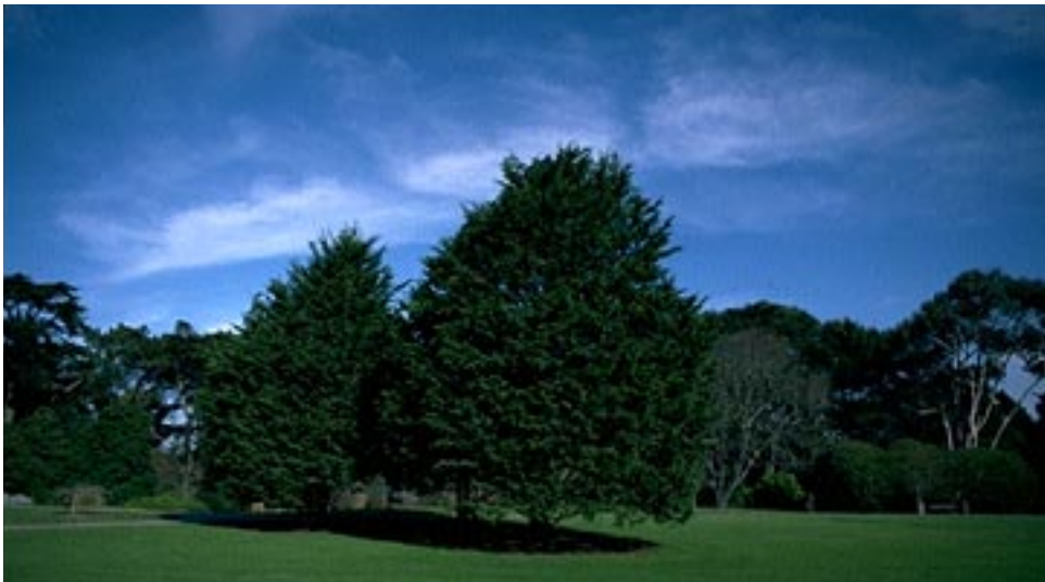
Plantings in a well-vegetated park, which are not exposed to winds atypical for the area, would be assigned to the average microclimate category ( k_{mc} = 1.0 ). These conditions are similar to those used for reference evapotranspiration measurements (CIMIS stations).

In a “high” microclimate condition, site features increase evaporative conditions. Plantings surrounded by heat-absorbing surfaces, reflective surfaces, or exposed to particularly windy conditions would be assigned high values. For example, plantings in street medians, parking lots, next to southwest-facing walls of a building, or in “wind tunnel” areas would be assigned to the high category.