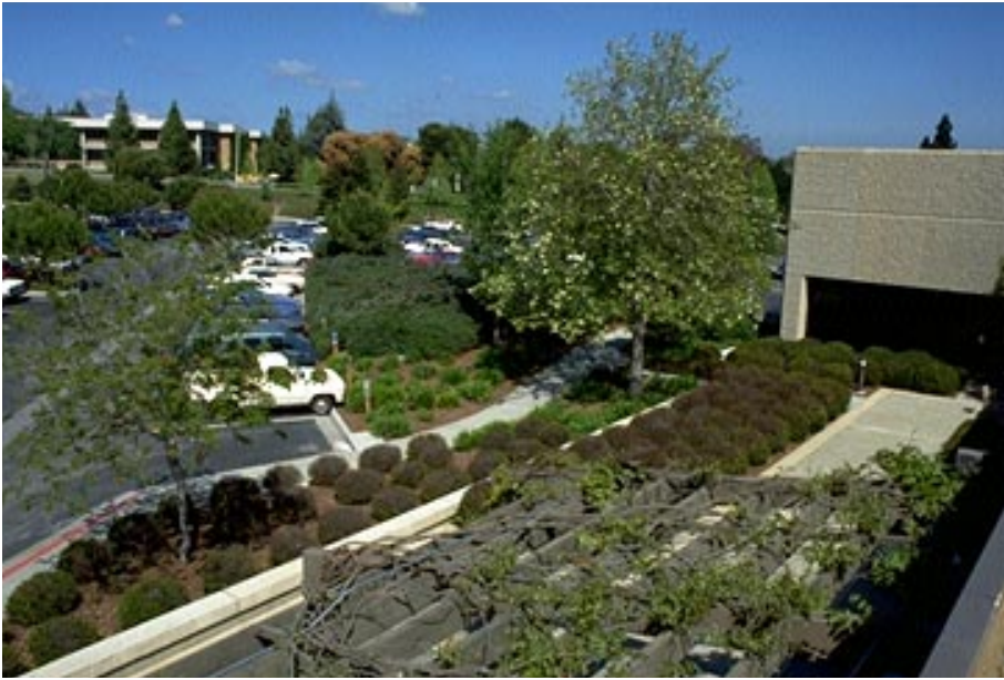
Unlike agricultural crops or turfgrass, landscape plantings are typically composed of many species. Collections of species are commonly irrigated within a single irrigation zone, and the different species within the irrigation zone may have widely different water needs. Using a crop coefficient for one species may not be appropriate for the other species.

ferent species within the irrigation zone may have widely different water needs. For example, a zone may be composed of hydrangea, rhododendron, alder, juniper, oleander, and olive. These species are commonly regarded as having quite different water needs and the selection of a crop coefficient appropriate for one species may not be appropriate for the other species. Crop coefficients suitable for landscapes need to include some consideration of the mixtures of species which occur in many plantings.