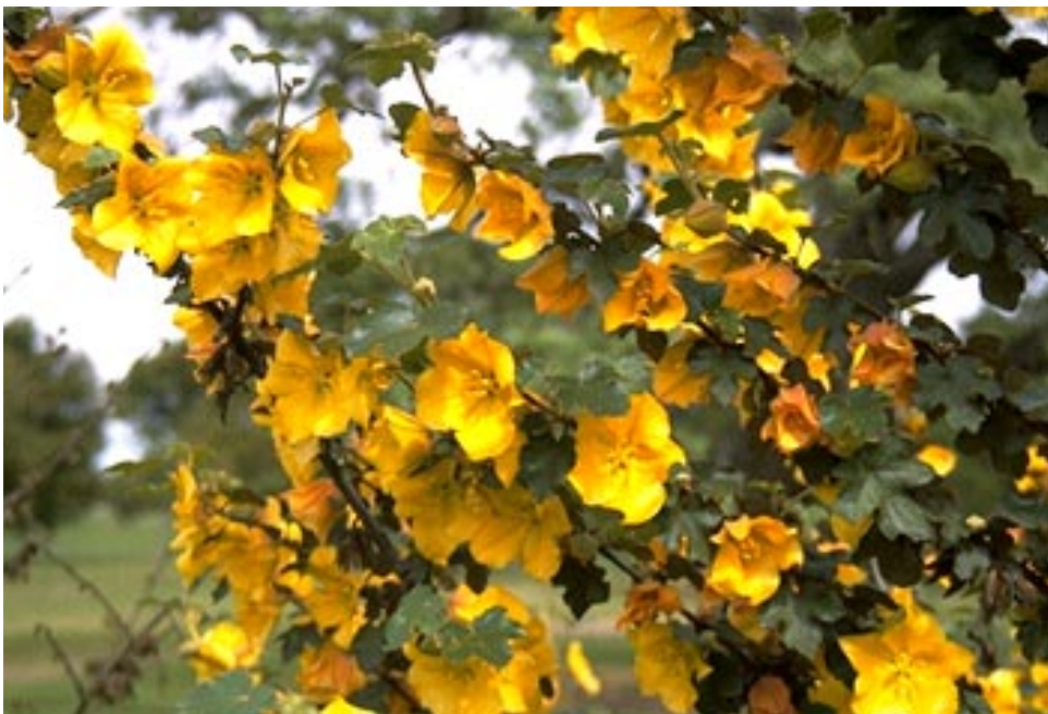
Some species, such as flannel bush ( Fremontodendron spp.), need very little irrigation water to maintain health and appearance.

Although the above example is straightforward, the assignment of species factors to plantings can be difficult. Refer to “Assigning Species Factors to Plantings” for guidance in making k_s assignments.