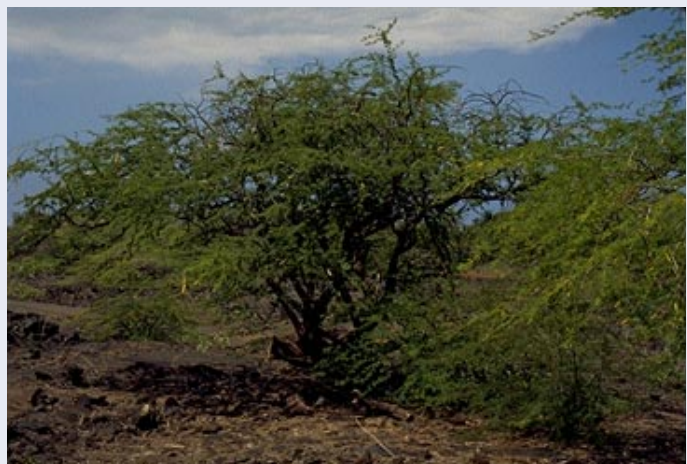
Some desert species, such as mesquite ( Prosopis glandulosa torreyana ), have been found to maintain ET rates equivalent to temperate zone species when water is available (Levitt et al 1995). When soil moisture levels decrease, however, ET rates in desert species decline rapidly.

The ET_L formula calculates the amount of water needed for health, appearance and growth, not the maximum amount that can be lost via evapotranspiration.