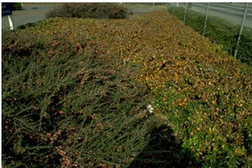
Plant injury may occur when species with different water needs are planted in a single irrigation zone. During a drought, irrigation was withdrawn from this planting of star jasmine ( Trachelospermum jasminoides ) and cotoneaster ( Cotoneaster sp). Subsequently, star jasmine was severely injured, while cotoneaster was not visibly affected.

Considering that plantings with mixed water needs are not water-efficient in most cases and