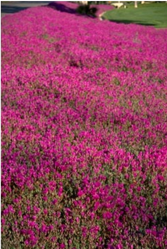
Plantings of a single species, such as this iceplant groundcover ( Drosanthemum sp. ), are considered to have average density ( k_d = 1.0 ) when full (90 - 100% cover).

Plantings of one vegetation type: for trees, canopy cover of 70% to 100% constitutes an average condition. For shrubs or groundcovers, a canopy cover of 90% to 100% is considered to be an average condition.