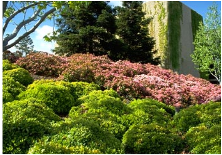
This mixed planting of Wheeler's pittosporum ( Pittosporum tobira 'Wheeler's Dwarf'), Indian hawthorne ( Raphiolepis indica ), American sweetgum ( Liquidambar styraciflua ), and coast redwood ( Sequoia sempervirens ) is considered to be average density ( k_d = 1.0 ). Trees are widely spaced through the sub-shrub/groundcover planting area.

Plantings of more than one vegetation type: for mixed vegetation types, an average density condition occurs when one vegetation type is predominant while another type occurs occasionally in the planting, and canopy cover for the predominant vegetation type is within the average density specifications outlined above. For example, a mature groundcover planting (greater than 90% canopy cover) which contains trees and/or shrubs that are widely spaced would be considered to be average density. Additionally, a grove of trees (greater than 70% canopy cover) which contains shrubs and/or groundcover plants which are widely spaced would constitute an average condition.