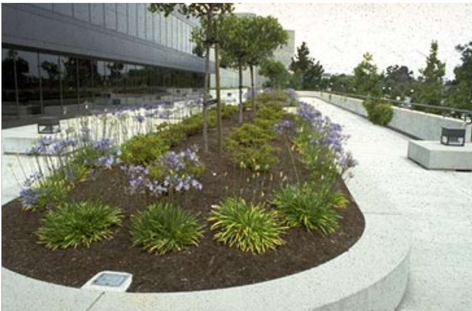
Plantings surrounded by heat-absorbing surfaces, reflective surfaces, or exposed to particularly windy conditions would be assigned a high microclimate value (1.1 - 1.4).

In a “high” microclimate condition, site features increase evaporative conditions. Plantings surrounded by heat-absorbing surfaces, reflective surfaces, or exposed to particularly windy conditions would be assigned high values. For example, plantings in street medians, parking lots, next to southwest-facing walls of a building, or in “wind tunnel” areas would be assigned to the high category.