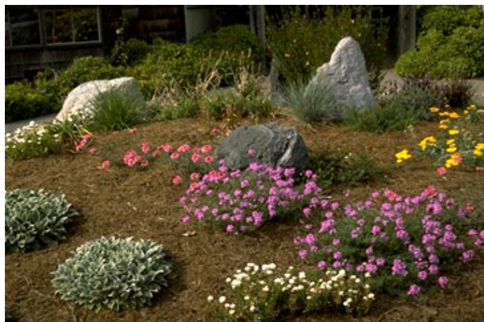
For shrubs and groundcovers, canopy cover less than 90% constitutes a density less than average ( k_d < 1.0 ). This mixed planting would be assigned a low density value (0.5 - 0.9).

The microclimate factor is relatively easy to set. An “average” microclimate condition is equivalent to reference evapotranspiration conditions, i.e., an open-field setting without extraordinary winds or heat inputs atypical for the location. This microclimate is not substantially affected by nearby buildings, structures, pavements, slopes, or reflective surfaces. For example, plantings in a well-vegetated park which are not exposed to winds atypical of the area, would be assigned to the average microclimate category.