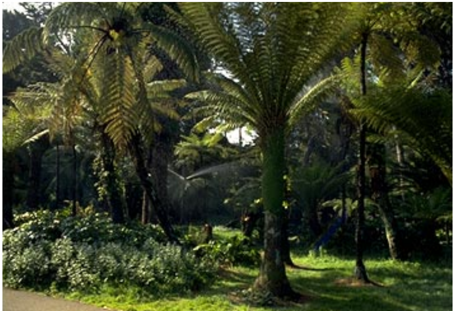
Certain species, such as tree ferns ( Dicksonia antarctica and Cyathea cooperi ), require relatively large amounts of water to maintain health and appearance.

Example: A landscape manager in Pasadena is attempting to determine the water requirements of a large planting of Algerian ivy. In using the ET_L formula, the manager realizes a value for the species factor ( k_s ) is needed in order to calculate the landscape coefficient ( K_L ). Using the WUCOLS list (Part 2), the manager looks up Algerian ivy ( Hedera canariensis ) and finds it classified as “moderate” for the Pasadena area, which means that the value ranges from 0.4 to 0.6. Based on previous experience irrigating this species, a low range value of 0.4 for k_s is chosen and entered in the K_L formula. (If the manager had little or no experience with the species, a middle range value of 0.5 would be selected.)