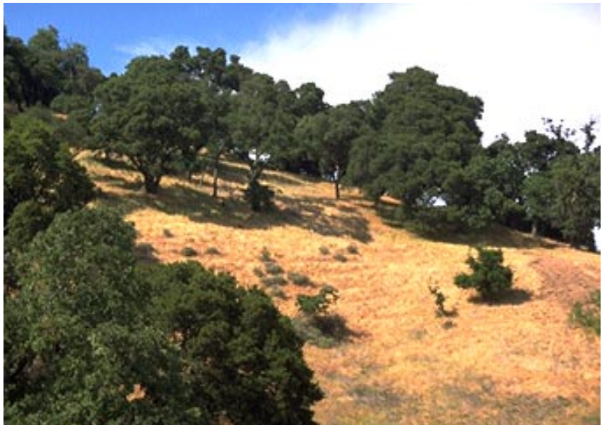
Certain species, such as these coast live oak ( Quercus agrifolia ), can maintain health and appearance without irrigation (after they become established). Such species are grouped in the “very low” category and are assigned a species factor of less than 0.1. Many California native species are in this category.